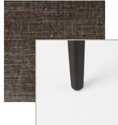
71268 Brown Fabric Dark Brown Legs