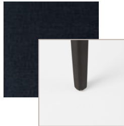
69562V Navy Fabric Dark Brown Legs