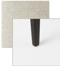
69399 Cream Fabric Dark Brown Legs