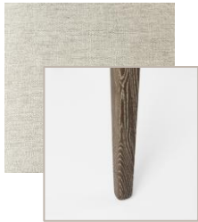
71265 Cream Fabric Med Brown Legs

Select styles will feature PFAS-free, C0 water-repellent treatments for added resilience.