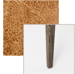
68232V Faux Leather Med Brown Legs