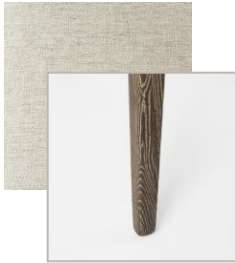
69398 Cream Fabric Med Brown Legs

Available NOW In Four Easy-to-style Finishes