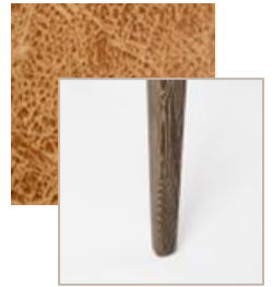
68323 Faux Tan Leather Med Brown Legs