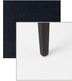
69562 Navy Fabric Dark Brown Legs